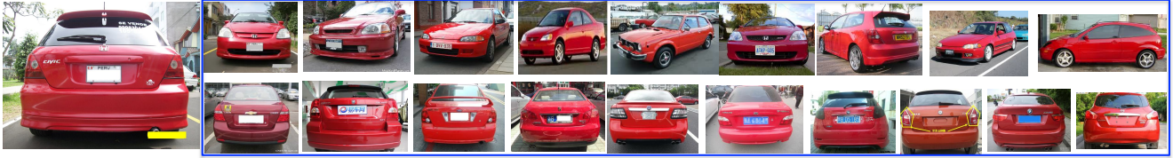
Figure 3. An query image (left) and retrieved images by Google (top right) and by Baidu (bottom right). Baidu search engine allows us to retrieve a large number of images with clean view annotations.

the class hierarchy is known or inferring the class hierarchy from the data), our approach is based on data augmentation which enables us to utilize as many auxiliary images as possible to improve the generalization performance of the learned features.