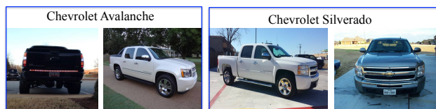
Figure 1. Illustration of large intra-class variance due to different views.

The goal of FGIC is to recognize objects that are both semantically and visually similar to each other. Since the seminal work of [23], deep convolution neural networks (CNN) have achieved the state-of-the-art performance on large-