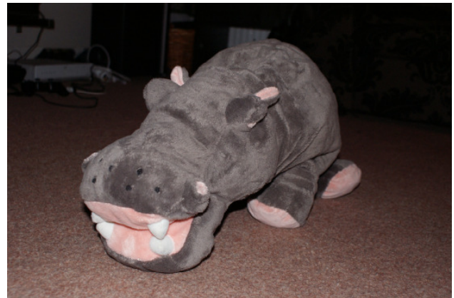
Figure 2 - Mr Hippo - showing his face

IDC 2009, June 3–5, 2009, Como, Italy Copyright 2009 ACM 978-1-60558-395-2/10/08... $5.00.