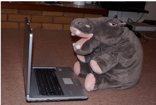
Figure 1 – Mr Hippo - showing his size

To prepare for the session three things are needed: a space where a group of around four children and an adult can work together, a semi-creative but tangible / haptic task (in this instance children were asked to design a game using dominos and playing pieces from board games), and Mr Hippo. Clearly Mr Hippo can be another animal! But some animals are probably better suited to this method than others.